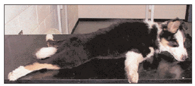
FIGURE 1 :The pup on day 1. She was recumbent, the muscles were contracted with the limbs, neck and tail hyperextended. The ears were erect and facial muscles were contracted with retracted lips, protruding nictitating membrane and enophthalmos.

Supportive nursing care is important as dogs are often hyperthermic,