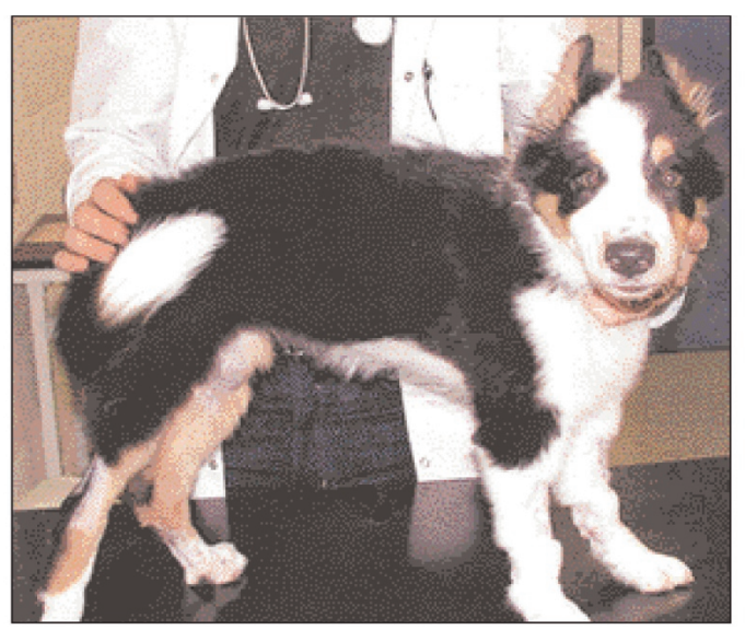
FIGURE 4: The pup after three weeks of intensive treatment. After three weeks of hospitalisation the clinical signs had almost completely resolved the ears were still erect and there was a mild lameness of the right hind limb.

Careful hand-feeding was continued, from an elevated platform to prevent regurgitation and aspiration of food. Also, she was placed with the front limbs and thorax elevated. After a further week there was improvement, she was more relaxed and vital signs returned to normal. Fluid therapy and intravenous antibiotics were continued and combined with metronidazole (Flagyl, May and Baker) per os (20mg/kg q12h) when she started to eat unassisted. Vital signs remained normal and the muscle rigidity improved. Radiographs were repeated on day 20 and there were no signs of hiatal hernia (Figure 3). After three weeks of hospitalisation the clinical signs had almost completely resolved. The ears were still erect and there was a mild lameness of the right hind limb (Figure 4). She was discharged and made a full recovery.