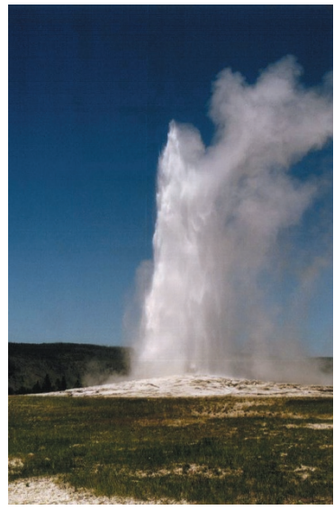
Thermostable DNA polymerases are a mainstay of PCR-based diagnostics.